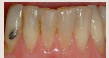
Examples of silver fillings