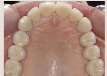
Build back your bite