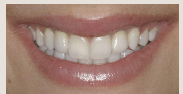
Build back your smile