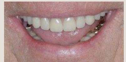
Restores smile and function