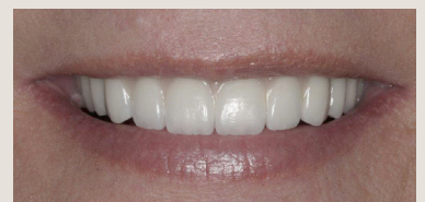
Builds back smile